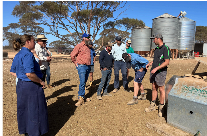
AgTech eID producer group, April 25