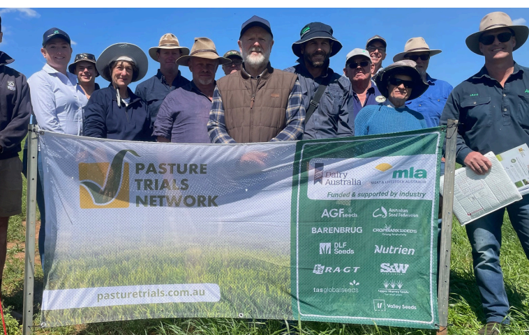
Pasture Walk, Oct 24