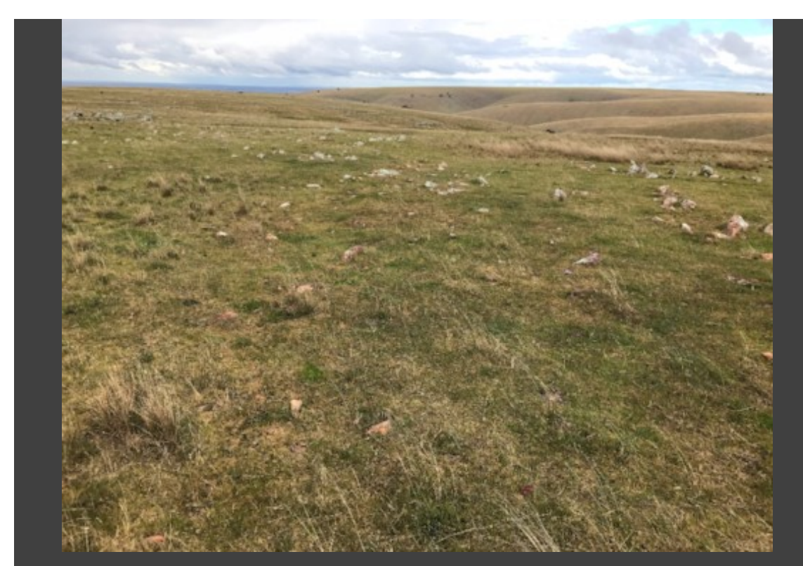
August 2017 the pastures contain over 100% ground cover with the winter grasses beginning to grow after the late break in the season.

Case Study- Kirsty and Jason Treloar, Keyneton