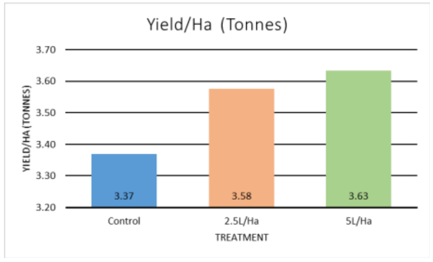
Figure 1:Yield from Folio-Zyme @ 2.5L/ha and 5L/Ha

Lucerne is a very important summer forage crop in SA with great grazing and hay making qualities, good dry matter (DM) and protein levels and outstanding ability to tap into moisture stored deep in the soil profile. Together with Stoller Australia and Pasture Genetics, Farmer Johns have been looking at squeezing every last bit of potential out of Lucerne crops on our Evaluation Site at Koonunga. By applying Stollers Foli-Zyme at 4L/ha and Canopy Master 10 at 6L/ha to Pasture Genetics L56, L71 and L71 + Chicory just after cutting, we were able to increase DM production by an average of 300kg/ha over the untreated control. This falls in line with research in other parts of SA which have demonstrated that 5L/ha of Foli-Zyme alone can increase production by up to 264kg/ha (Figure 1).