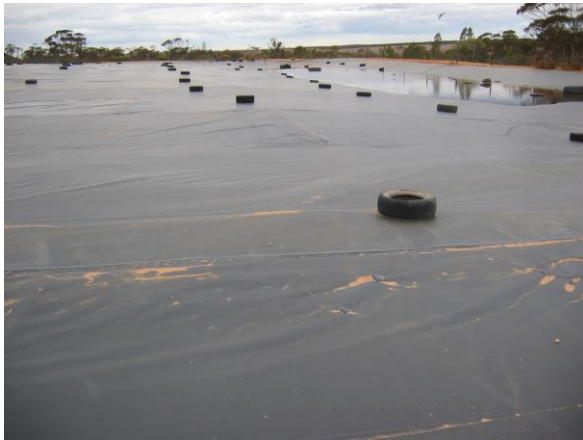
Kelly Eastern Eyre Pen