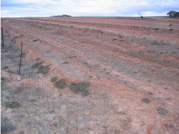
Mangalo north Cleve