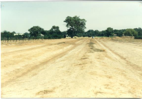
Nuri Research Centre 1990s