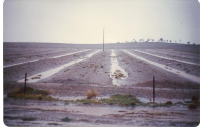
Sims Farm 1970s