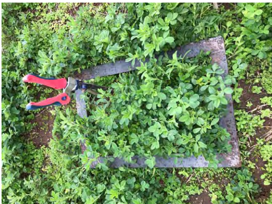
The older lucerne stand measuring 1700 kg DM/ha in September 2017

The lucerne started to germinate five weeks later; lucerne has a staggered germination, so plants continued to establish throughout the winter and spring months. After 14 weeks, in early spring, the pasture was sprayed with a selective to remove grass competition.