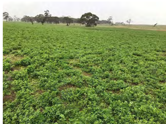
The older stand in September 2017