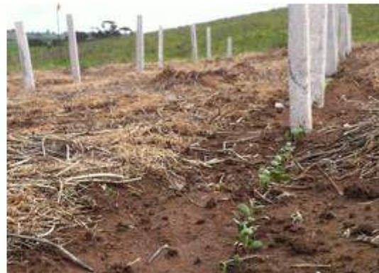
Layout of the sub-clover trial plots conducted at Moculta (June 2014)