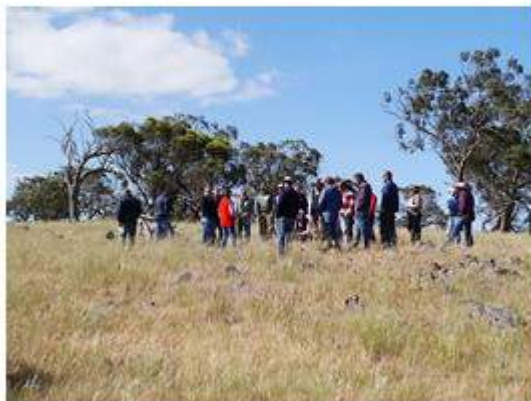
Producers learn about native grasses at the BIGG field day